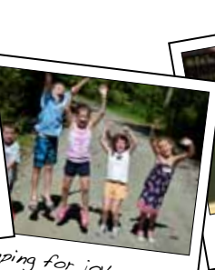
jumping for joy