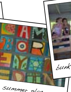
our summer place