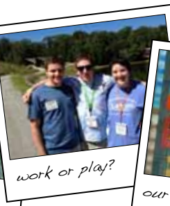
work or play?