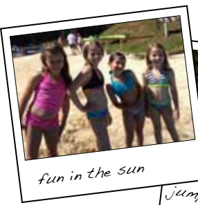
fun in the sun